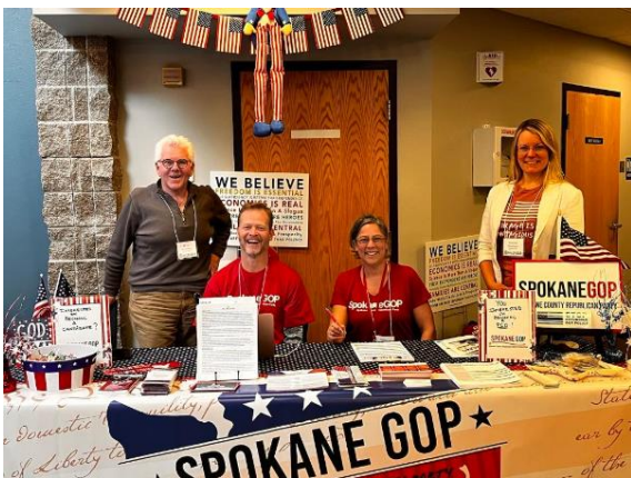
GOP at the 27th annual Christian Family Home Education (CFHE) annual homeschool event. (Left)

You have to give credit where it's due; they are relentlessly trying to usurp the nuclear family and replace it with State control. We do not have to stand for this. We must fight this battle starting at our dinner tables. We must talk to our children about real life and what's happening in the world. We have to take an active interest in their hobbies. There will come a time when they leave the nest and, on that day, we each need to be able to say, "I gave my sons and/or daughters all the tools necessary to think for themselves critically and make the right choices". Personal excellence is the ultimate rebellion against the government. That rebellion starts at home.