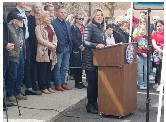
Mayor Nadine Woodward at a press conference, South Police Precinct, 524 S Stone. In support of Chief Meidl. More than 100 constituents showed up in support. (Right)